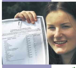
Follow up courses (5<sup>th</sup> & 6<sup>th</sup> Year) available in Dublin and in France (June) — also on line.